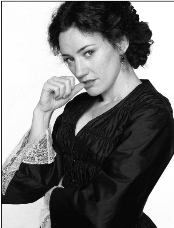
Flora Ryan is the senior female member of staff, permanently resident at Taplows, and in charge of all the female servants. She has considerable managerial and pastoral skills but the stresses of the job can get to her. She has chosen career and security over romance and marriage – a choice she tries not to regret.

“You know Flora’s never going to be the paragon of efficiency and organisation she feels she should be. She’s just not the right temperament for the job,” Orla Brady says affectionately of her character. “She should be a good Catholic girl, a farmer’s wife in the West of Ireland with a brood of kids clutching at her skirts.